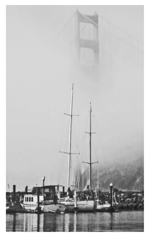
Sandpiper cont. from pg. 1...

As your life takes you to new places, please keep us undated with your new